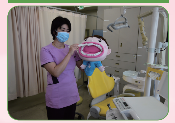
"Hidamari Dental Office", a dental clinic for disabled persons, was opened (January 8th)

The nickname "Hidamari" reflects our hope that our patients will be able to safely receive treatment in a sunlit, warm and bright room.