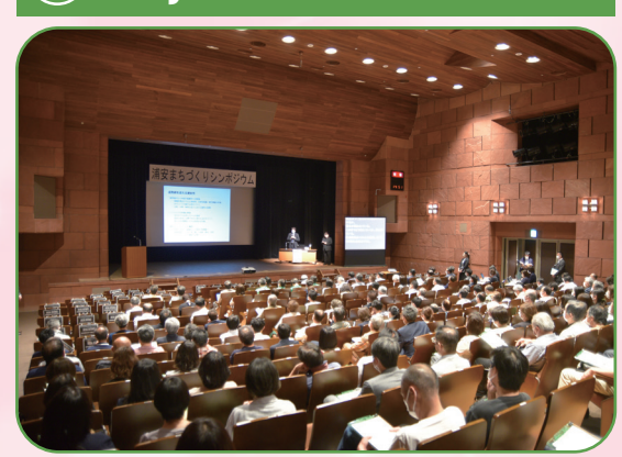
Urayasu City Planning Symposium (May 29th)

Keynote speeches and panel discussions were held regarding the significance of enacting the Urayasu City Planning Ordinance and on applying the city planning ordinance