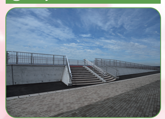
Opening of the ramp along the Urayasu coast in Akemi and Hinode areas (July 15th)

When you go down the ramp toward the end of "Symbol Road," a view of the ocean spreads across, and the sea breeze will remind you of Urayasu, which used to be a fishermen's town.