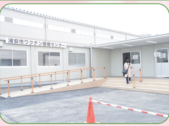
Urayasu City Vaccination Center was established (February 19th)

To accelerate vaccinations, a facility with a large waiting area and air conditioning was established next to the Hinode Public Hall.